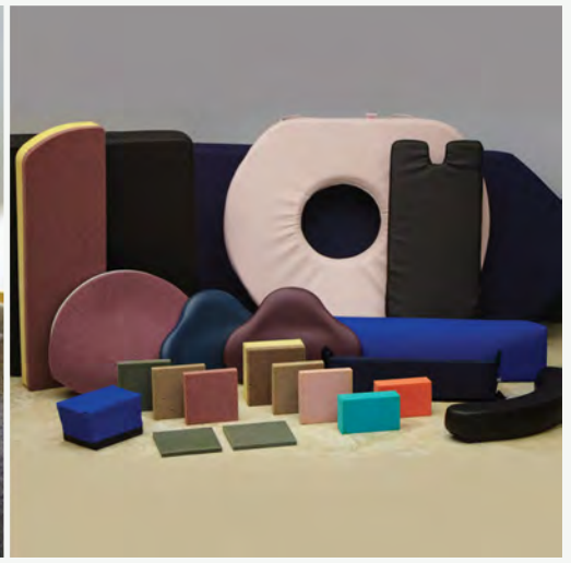
Clinical Support Solutions • Advanced Ergonomic Seating • Custom OEM Products